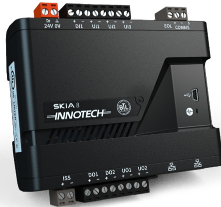
(SK8CD Model shown for illustration)

The controller should be installed in an environment that does not exceed the maximum operating parameters of the device. It should be mounted in a clean and dry environment free of vibration, and properly ventilated.